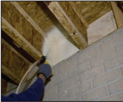
After picture framing, spray rim joist area to a maximum of 2" thick.