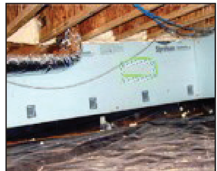
Typical applications of FROTH-PAK™ Foam Insulation in rim joist areas.