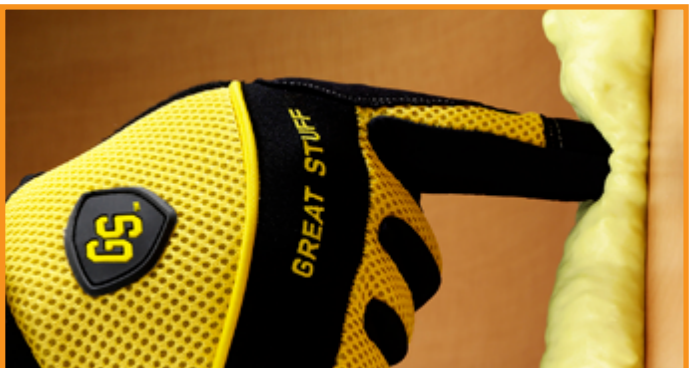
When cured, remains soft and flexible. Cured foam can be stuffed back into the gap without trimming.