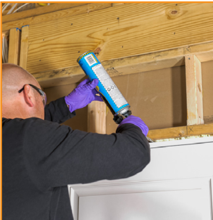
Doors and their rough openings