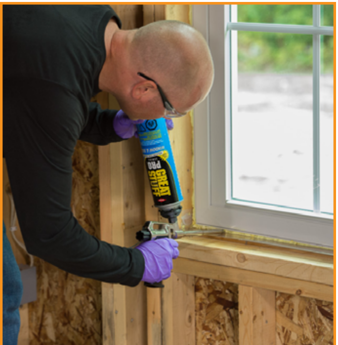
Window and their rough openings