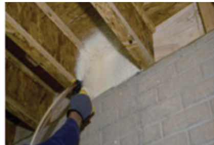
After picture framing, spray rim joist area to a maximum of 2" thick.