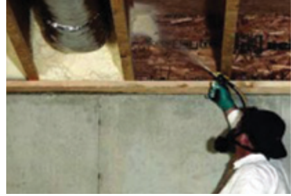
Applying an initial bead of foam where the rim joist meets the subfloor is called "picture framing."