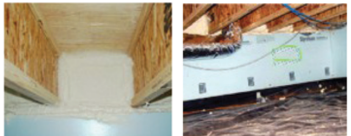
Typical applications of Froth-Pak™ Foam Insulation in rim joist areas.