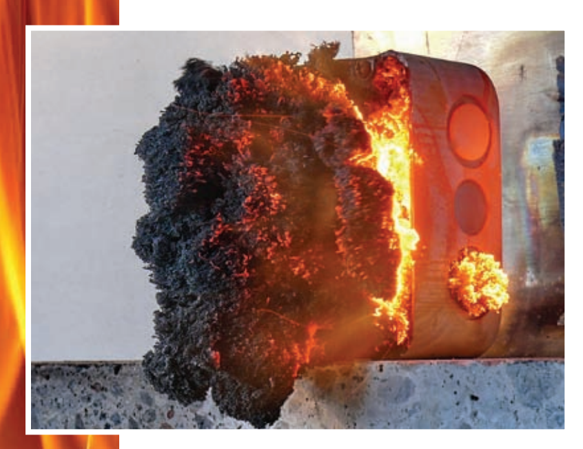
Figure 3 An intumescent electrical box insert

protection of the structure, and they also help maintain a minimum degree of protection for occupants who live or work in a structure and for fire safety personnel who must enter the building if a fire occurs.