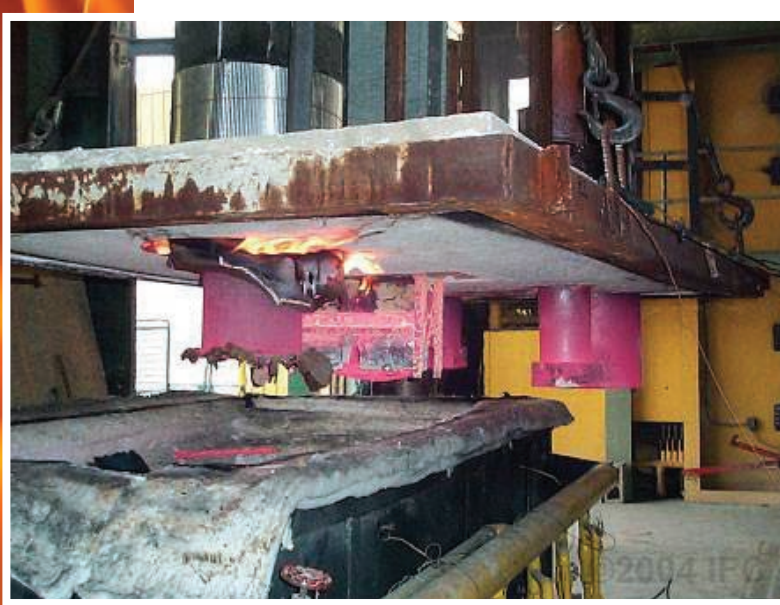
Figure 1 Assemblies are tested in a furnace to determine their fire rating.