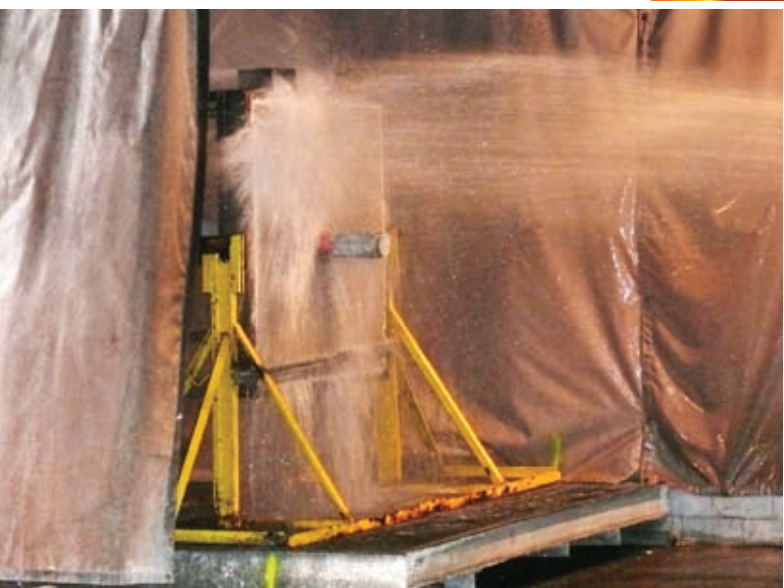
Figure 2 Assemblies are subject to a hose stream test to determine overall integrity.